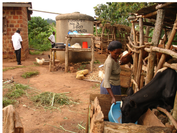
Rural women able to eliminate poverty and build healthy communities